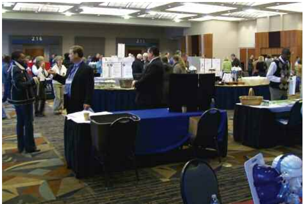
Pulmonary Conference held at the Qwest Center Omaha.