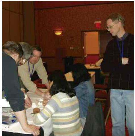
Surgical Techniques Conference held at Embassy Suites, LaVista, NE

Attendees are provided latest guidelines and standards.