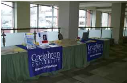
Conference held at Creighton University Harper Center.

Increased Revenue: Registration and administrative fees have been increased 10-15%, further studies are being conducted to determine staff time expended on activities, a survey has been developed to forward to department/division chairs, faculty, course directors, planning committee, etc. Quarterly budget reports will be provided the Dean.