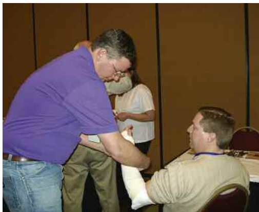
Surgical Techniques Conference held at Embassy Suites, LaVista, NE

Outcomes Measurement of Ignation Values in CME Activities: We are developing information for planning committees and presenters that will enhance their understanding of ignation values and how they can be implemented into our CME activities. Our evaluations are also being updated to include measurement of change in learners due to implementation of ignation values into our activities. More explanation of this is found on page 6 in the Scholarly Activities section.